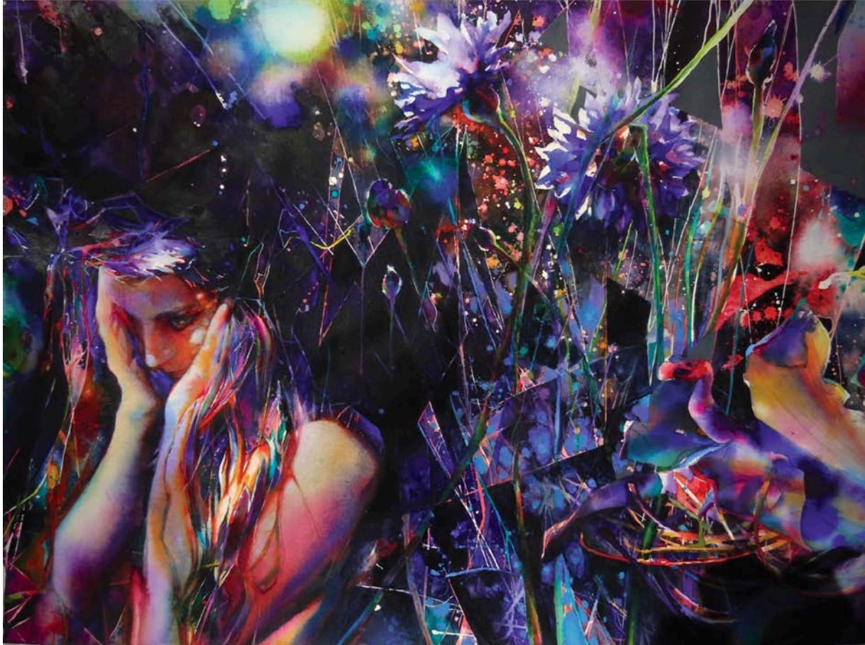
Path of Light(detail), Brent Funderburk, watermedia on paper, 2024

November 14-16, 2024 Mississippi Museum of Art and Pearl High School