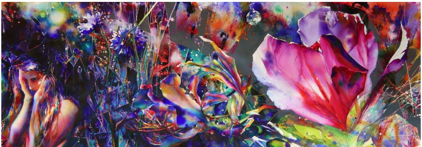
Path of Light , Brent Funderburk, watermedia on paper, 2024.